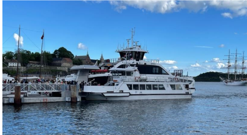
(June 2022 - Electric ferry in Oslo)

23- Electric ferries: Canada is home to over 180 different ferry routes with a route presently operating in each province and the majority of the territories 15 . When we went to Norway in 2022, we discovered that out of 825 ferries in their country, 47% of them were already electric. The largest electric ferry 16 has room for 600 passengers and 200 cars or 24 trucks. We recommend that the federal government launches a program to support the electrification of ferries in order to lower GHG emissions, air and water pollution AND create a Canadian zero emission marine industry to become a North American leader.